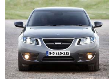
SAAB 9-5 NG built beteween 2010 and 2012

Models with basic radio use 42ssa001 steering wheel control interface. Models with Denso navigation use 42k-1230-007 on cars with paddle shift gearbox or interface 42k-1230-006 on cars with a paddle shift gearbox.