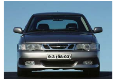
SAAB 9-3 OG built between 1998 and 2003

The easiest way to tell which version you have is to check the year and the front of the car as they are all destinctively different.