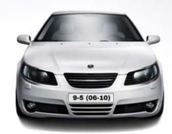
SAAB 9-5 OG (Facelift 2) built between October 2006 and 2010

The SID has 8 trip computer functions. Some late models come with optional Denso Satnav. All models use 42k-1230-005 steering wheel control interface.