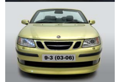
SAAB 9-3 NG (Pre-facelift) built between 2003 and 2006

Convertible models were built until 2003, 3/5 door hatchback production ended in 2002. The front bumper and chrome front grill are separate and headlamp wipers were optional All models use the 42k-1230-004 steering wheel control interface to change the radio.