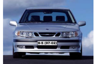
SAAB 9-5 OG (Pre-Facelift) built between 1997 and May 2002

All models use 42ssa001 steering wheel control interface to change the radio.